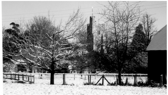
St Nicholas Church in the snow